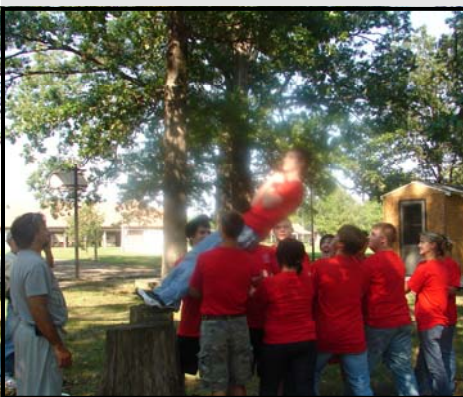
The trust fall was the most popular activity of the team building ropes course during LDC.