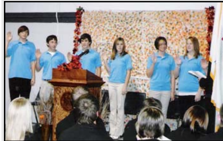
The Illinois Career Association officers take their installation oaths.

ceremony was meaningful because it was planned and arranged by the students.