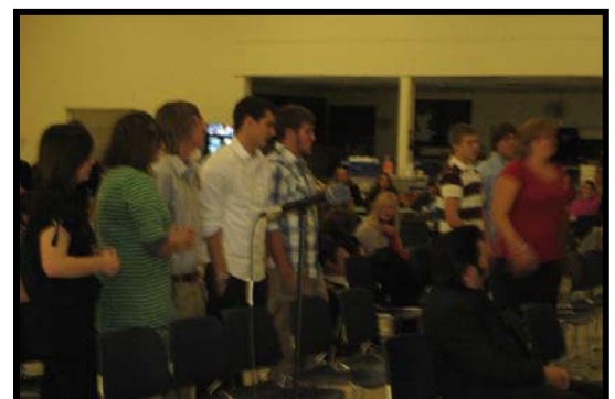
The Pinning of our new ICA Members