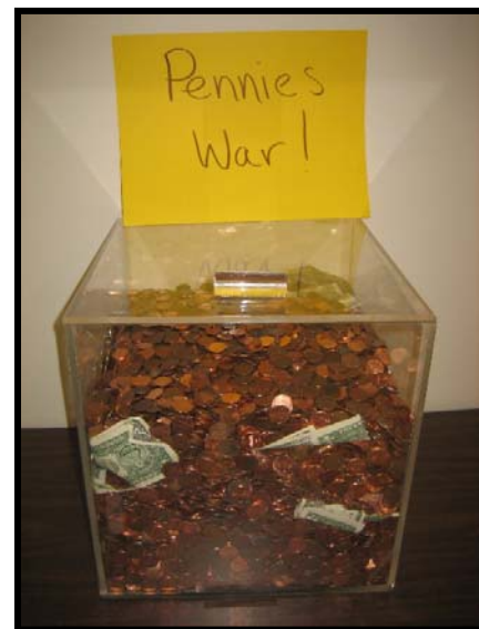
This was just after the first week. The second week was just as full.