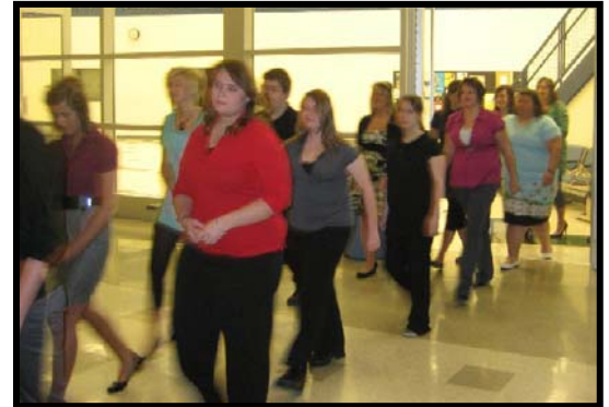
The members enter to "Time of My Life", sung by David Cook, American Idol.